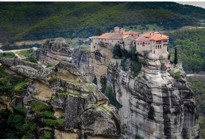
HANGING MONASTERIES METEORA